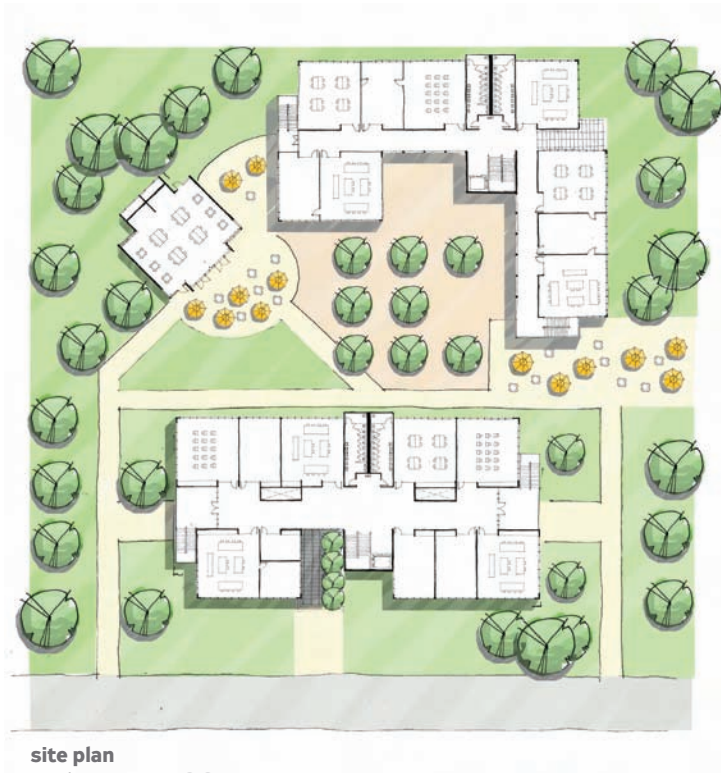
site plan student union ex3.2.1