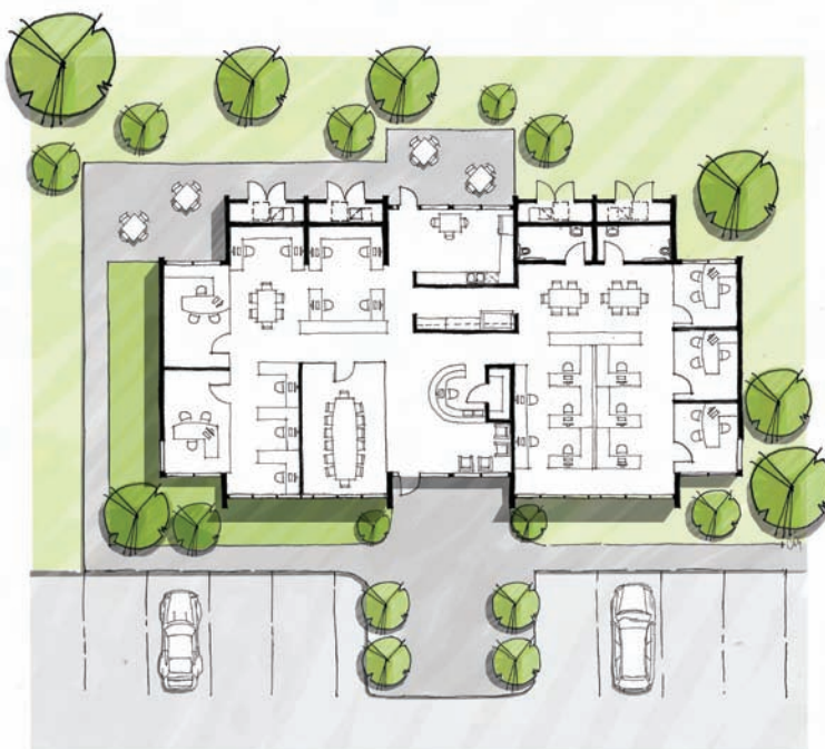
site plan small office ex8.2.1